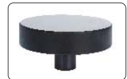
Ø78mm flat anvil (included)