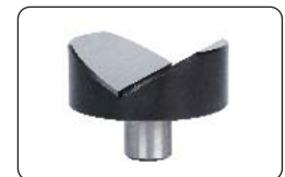
V-type anvil (included)