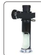
measuring microscope (included)